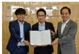
Announcement of BOOK, Tagawa City and FDC collaboration

We established Fukuoka Startup Library with Tagawa City and BOOK which has the concept of Kyushu Contents Valley and support continuous and lasting business creation in Chikuho area. We also promote reutilization of old schools such as "Iikane Palette" by collaborating with other facilities in other prefectures.