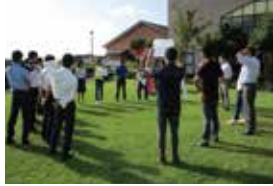
Workshop in Iki city

As part of regional revitalization projects, we work for introduction of "Continuing Care Retirement Community" in Japan. In 2017, we engaged to formulate basic guidelines/plans and host workshops for citizens in Iki city.