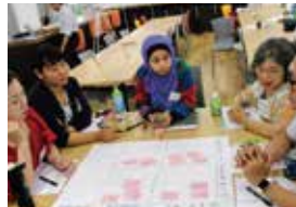
Workshop of Fukuoka living lab for dementia and care prevention

As part of Fukuoka Health Lab, we jointly hosted "Fukuoka living lab for dementia and care prevention" with member companies. We deepen ideas by having theme as "the place where you can discuss about nursing care, dementia and view of life and death" at workshops.