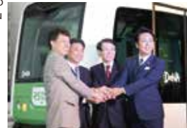
Setting up the consortium for promoting smart mobility

We engage in projects for creating new social system based on ICT. We established "Consortium for promoting smart mobility" with member companies for the service of self-driving bus in Ito campus of Kyushu University.