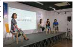
The third anniversary event of national strategic special zone

It has been three years since the Japanese government designated Fukuoka as the national strategic special zone for global startups and job creation. We will continuously work for realization of industry-academia-government-citizens collaborated special zone with Fukuoka City.