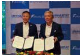
Conclusion of agreement in 2016

We concluded a comprehensive collaboration agreement with UN Habitat Fukuoka Office aiming for realization of sustainable development of Asian cities. We examine possibilities of utilization of technologies and knowledge of FDC member companies and creation of businesses in other areas.