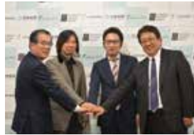
Announcement of the program

We collaborate with the acceleration program "Mirai", create public-private collaborating projects, develop advanced businesses in the national strategic special zone, and support creating innovation in fintech field through the consortium "Incubation & Innovation Initiative" where Mitsui Sumitomo Bank and the Japan Research Institute participate aiming for open innovation.