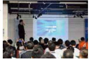
The caretech event named "Models for society of health and longevity in 2025".

Digital Garage has knowledge, experience and network for startup support and various investment by running the co-working space "DG717" in San Francisco and acceleration programs such as Open Network Lab. Utilizing these knowledge, we support creating new businesses.