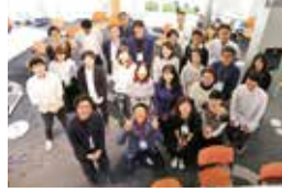
Members of regional revitalization project for Ohashi shopping streets

We support activities for revitalization of local shopping streets as part of regional revitalization projects with Fukuoka City. Through this project, we create new ideas for revitalization by various field works and workshops and develop partners to collaborate with.