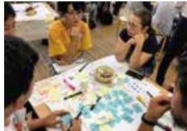
Workshop of Fukuoka health lab

This is a system to investigate, evaluate and certify effects of products and services which make people healthy while giving joy. This system encourages the use of products and services for healthcare and care prevention with collaboration of citizens, entities and universities.