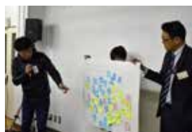
Discussion in Future Center Alliance Japan 2017 Fukuoka

We collaborate with the alliance "Future Center Alliance Japan (FCAJ)" which accelerate innovation through creating network of public, private and academic sectors. We aim for encouraging new business creation by citizens in Fukuoka by this alliance.