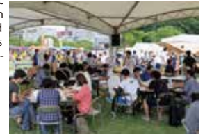
Workshop in Disaster prevention camp

We work for the platform to promote co-development for disaster prevention by various actors such as citizens, companies, NPOs and public sectors together with Fukuoka City and Pop-up Commons preparatory committee.